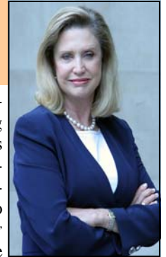
Congresswoman Carolyn Maloney

On Wednesday, August 26, 2009, API members and friends will gather on the Paulsdale porch to celebrate Women's Equality Day. This celebration honors the struggle that suffragists, like Alice Paul, endured for women to have the right to vote. Congresswoman Carolyn Maloney, another woman who continually presses for change, will help API celebrate the 89th anniversary of this historic event.