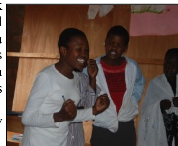
All smiles during a team building activity.