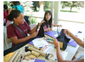
Girlblazers camp 2010