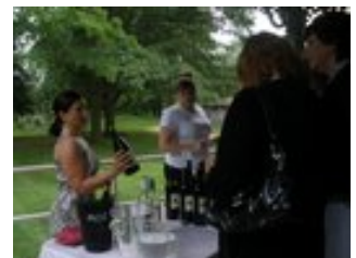
Wine Tasting 2010