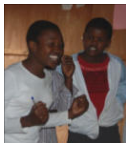
Girls at the Awegys School, Uganda