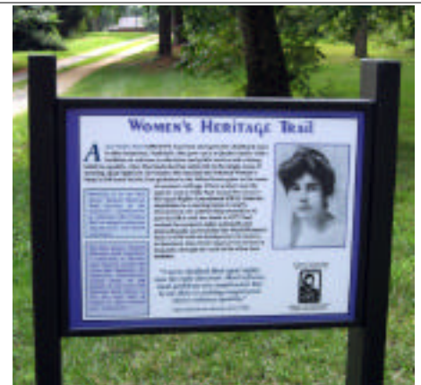
API's New Jersey Women's Heritage Trail marker, designates Paulsdale as one of 94 sites related to the lives of New Jersey women. The Alice Paul Institute served as project coordinator for the development of the Trail. New Jersey Women's Heritage Trail, a booklet including a description of each site, was published in 2004 and is available for purchase at API.