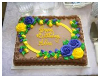
Happy Birthday Alice!