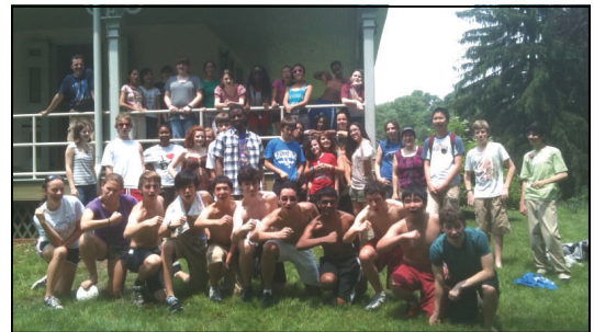
High school students from the J.R. Masterman School got together for a class photo after their tour of Paulsdale.

This project also coordinates nicely with another planning project API recently completed through a grant with the New Jersey Historical Commission. This project will allow us to design an exhibit at Paulsdale to tell Alice Paul’s story in a more effective way. With a potential new exhibit, marketing initiatives and directional and way-finding signage, API has pulled through the Great Recession with even more passion than ever before to bring even greater numbers out to historic Paulsdale to celebrate one of America’s greatest heroes- Alice Paul.