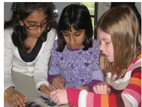
At right: 4th grade students from Mount Laurel participate in a Meeting Alice Program .