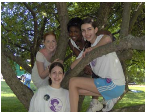
At left: former Girls Advisory Council members at Paulsdale .