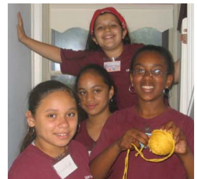
Girl Scout leader at G.O.L.D.