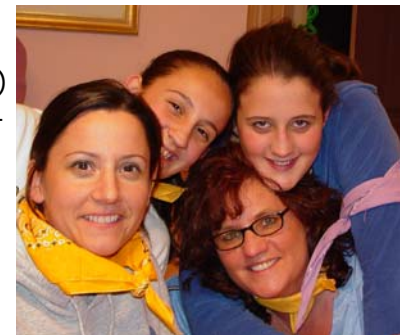
Alice Paul is a great role model for girls—and their moms. Everyone should know about Paulsdale!