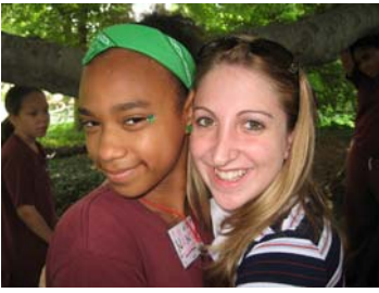
Girlblazers Leadership Camp—Summer 2007