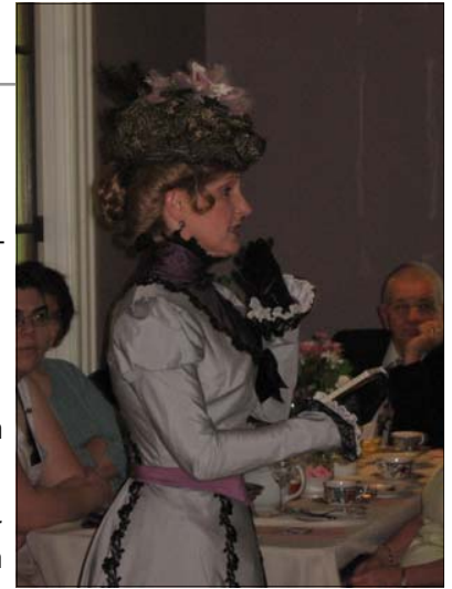
Mother's Day Victorian Tea