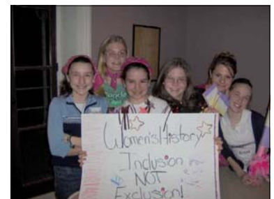
"Women's History: Inclusion Not Exclusion"—GOLD 2007