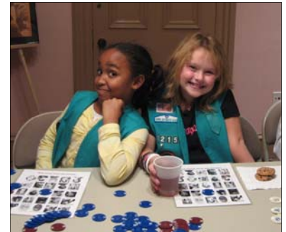
Girls Scouts playing Home Grown Heroines—Celebrate NJ Women Fall 2007