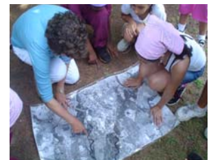
Girlblazers Summer Camp